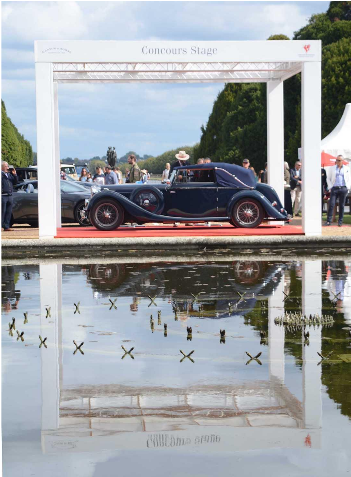
Miles Pinniger's Speed 25 Offord DHC