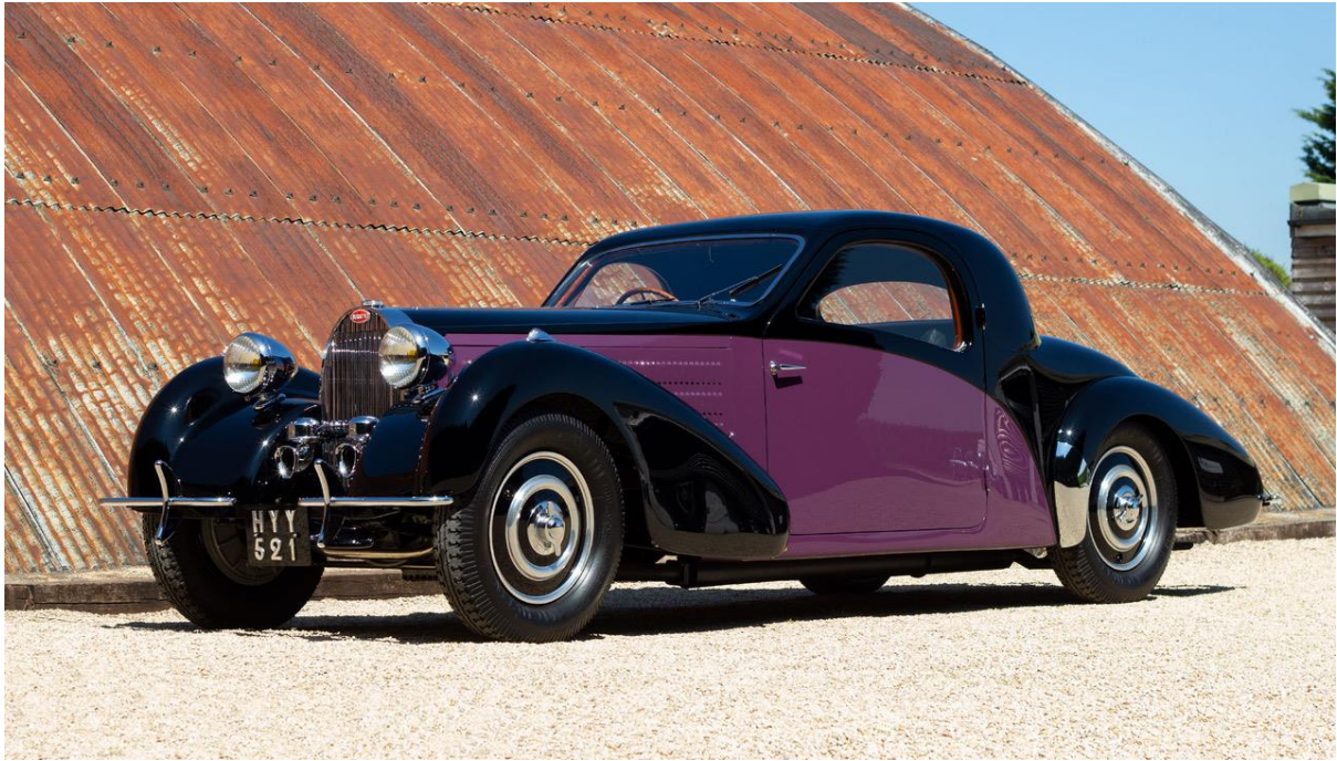
1938 Bugatti Type 57 Atalante by Gangloff, winning the Bridge of Weir Leather Design Award