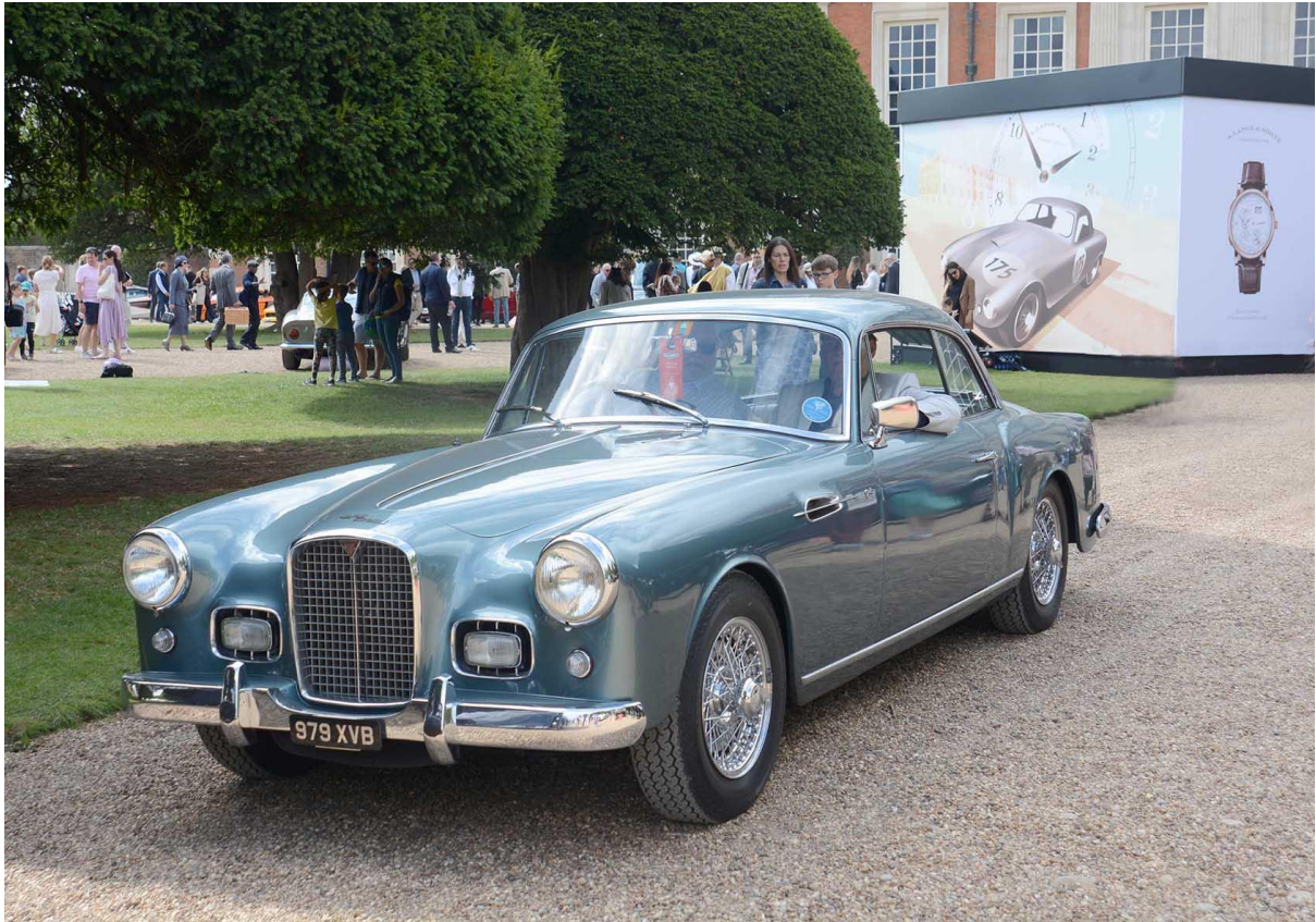
Awaiting the podium drive-past

Our Concours results from self-judging of other owner's cars were as follows: