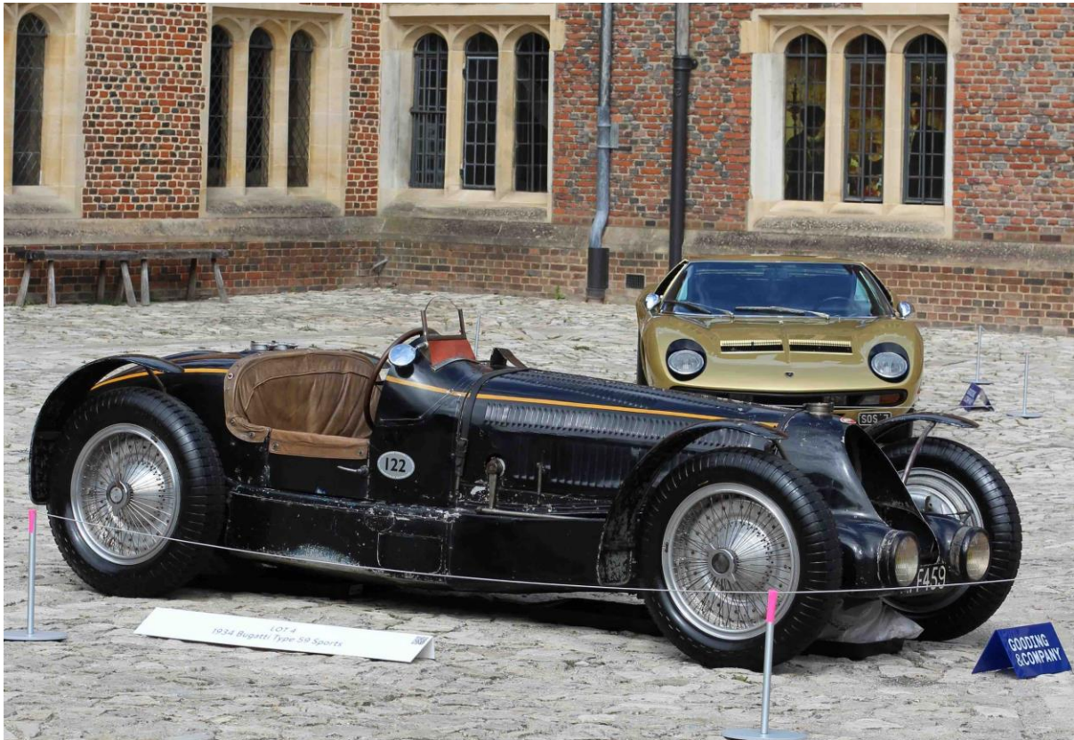
1934 Bugatti Type 59 Sports in well patinated condition.

Hidden nearest the Flower Pot gate on Saturday were three Bugattis, two being Grand Prix Type 37 but my favourite was an English -registered Type 57s with Stelvio cabriolet coachwork by Galibier. That could be compared with another Type 57 Atalante fixed-head coupe in the main Concours, resplendent in purple/black with coachwork by Gangloff, which is on the market for around £1.5 mio, but even these pale into insignificance compared to the 57S Atlantic Coupe and a sports type 59 which in the Saturday's Gooding sale fetched £8.5-9.5 mio apiece, the newest high record for a 57S. It certainly did not seem that the pandemic had affected prices negatively in this sale, with over £33.86 mio taken, selling all but one of 15 cars; quite a result for their new entry into the European auction platform.